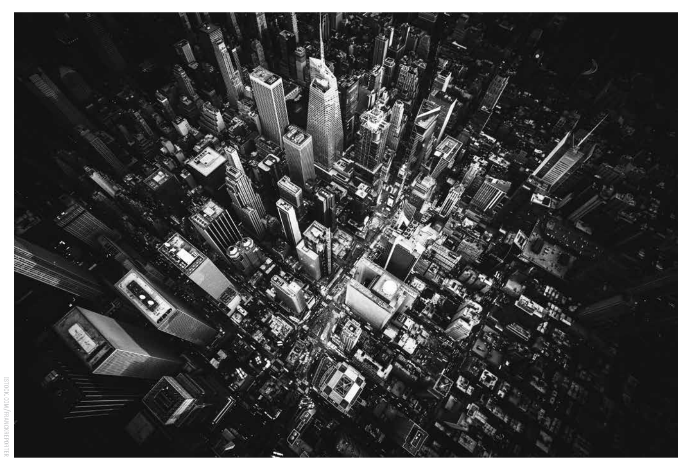
Jesus Christ didn't give in to Satan's offer of ruling the world immediately.

promises to care for His people, He tells us not to tempt Him by doing foolish or selfishly inspired things to try to force God to fulfill a promise.