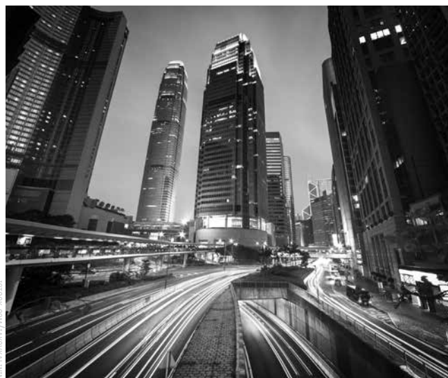
Man has been running things his own way for 6,000 years.

How will Christ actually stop so many people who are so deceived by Satan from committing so much sin? How will He educate them in God’s wonderful way of life? He won’t do it alone; He will do it with the help of those being trained right now, members of God’s Church with God’s Holy Spirit who will be born into His Family when He returns.