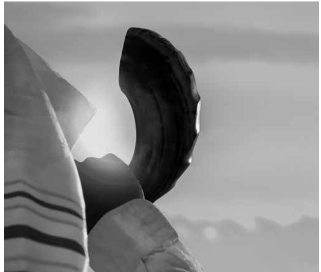
Anciently, the priests in Israel would blow a trumpet made from a ram's horn on the Feats of Trumpets.

The Feast of Trumpets is the first fall festival. It is a high holy day, and it represents the fourth step in God's plan. This is the step that comes after God's people have qualified to rule with Jesus Christ.