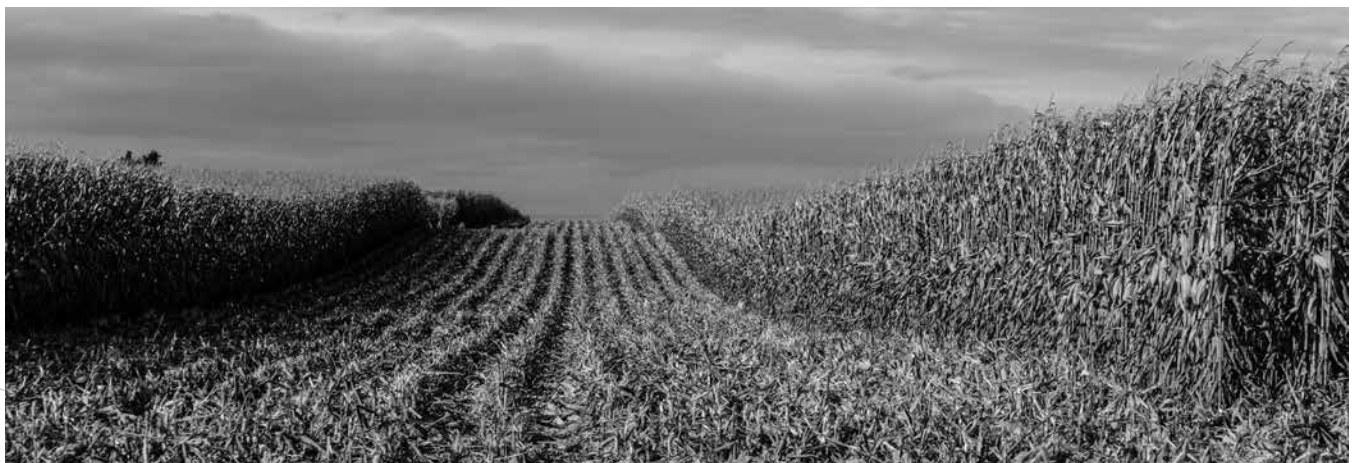
The Feast of Tabernacles is also called the feast of ingathering, because it celebrates the greater fall harvest.

Living in temporary dwellings during the Feast of Tabernacles reminds us that our lives are temporary. We cannot live forever, unless we are born as spirit beings in God's Family. Only members of God's Church