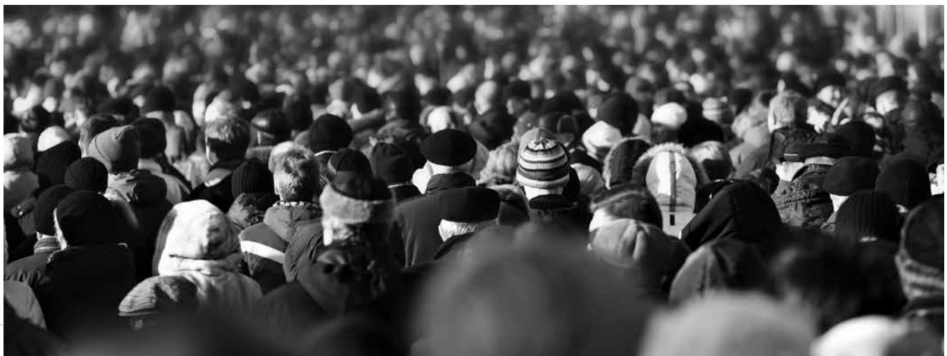
The holy days picture God's plan, which involves all men who have ever lived.