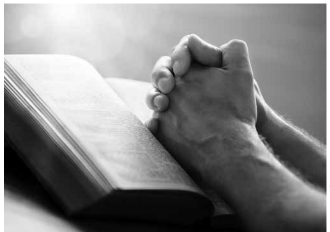
Fasting on Atonement gives us more time for prayer and study.

Turn to Ezra 8:21 to see how to humble yourself before God: “Then I proclaimed a _____ there, at the river of Ahava, that we might _____