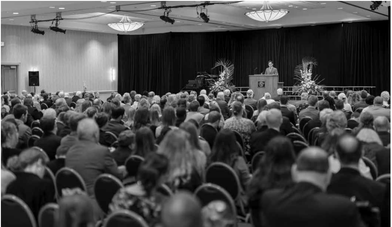
The Feast of Tabernacles is a time of intense instruction from God's ministry.

interfering as Christ teaches everyone God's way of life.