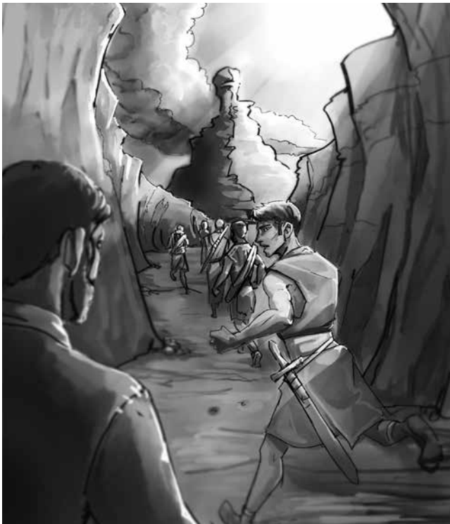
David flees to the wilderness to escape Saul's wrath.

Fill in the blanks using 1Samuel 24:4 to see how David's men responded to this situation: "And the men of David said unto him, _____ the day of which the _____ said unto you, _____, I will deliver your _____ into your _____, that you may do to him as it shall seem good unto