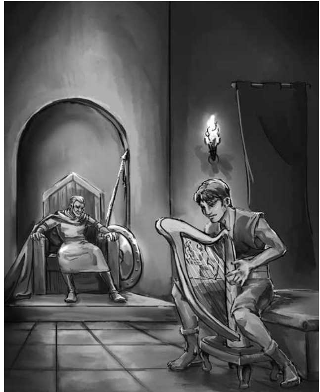
David plays the harp in Saul's court to soothe the king.

Saul reacted to David with a carnal, selfish and even hateful attitude. The Prophet Samuel had told Saul that he would