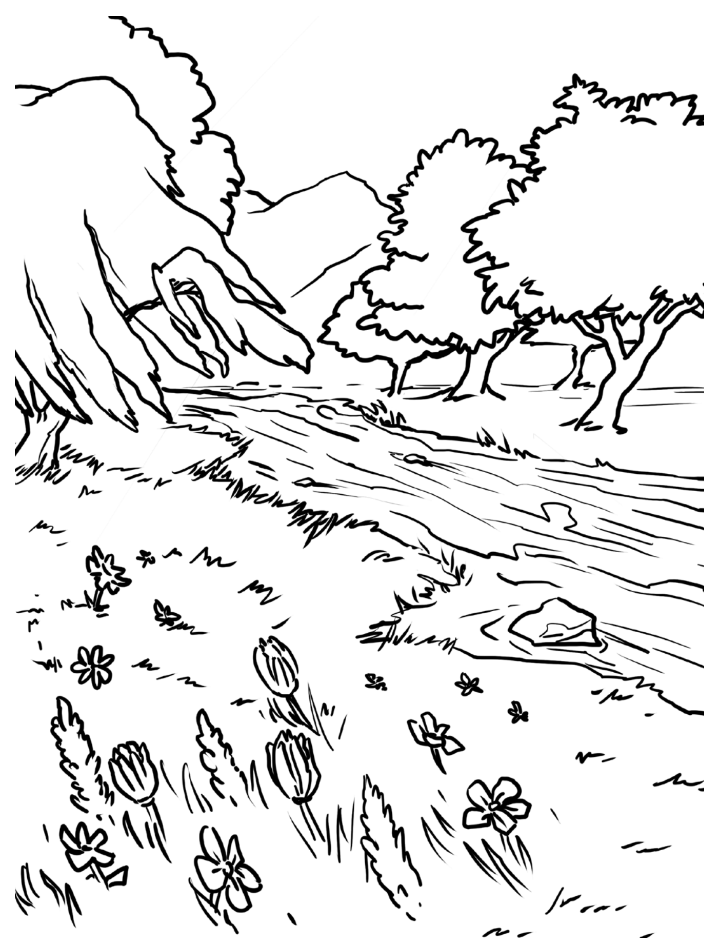
The Garden of Eden was an ideal setting for Adam and Eve to learn.