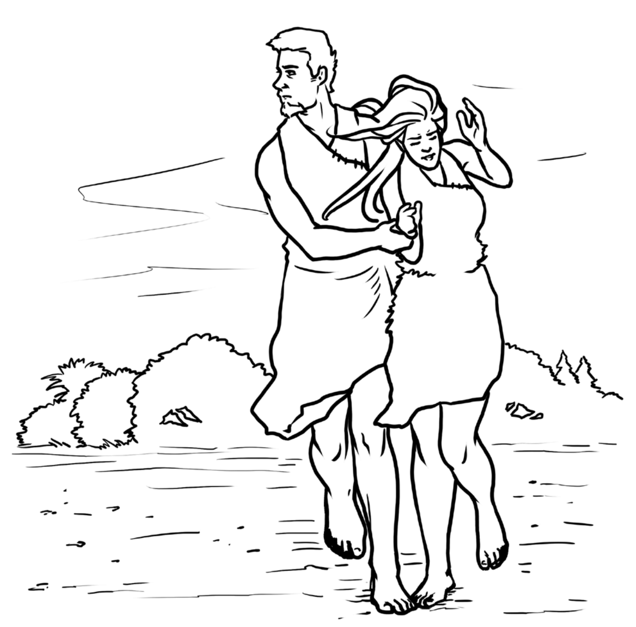
After eating from the tree of the knowledge of good and evil, Adam and Eve are driven out of the garden.

that someday a Savior would come. This Savior would have to die for their sins. Without this Savior, they could never repent, never eat from the tree of life and never have eternal life. To remind them of how much they needed this Savior and how much they needed to repent, God told Adam and Eve to kill a lamb and burn it on an altar at certain times of the year.