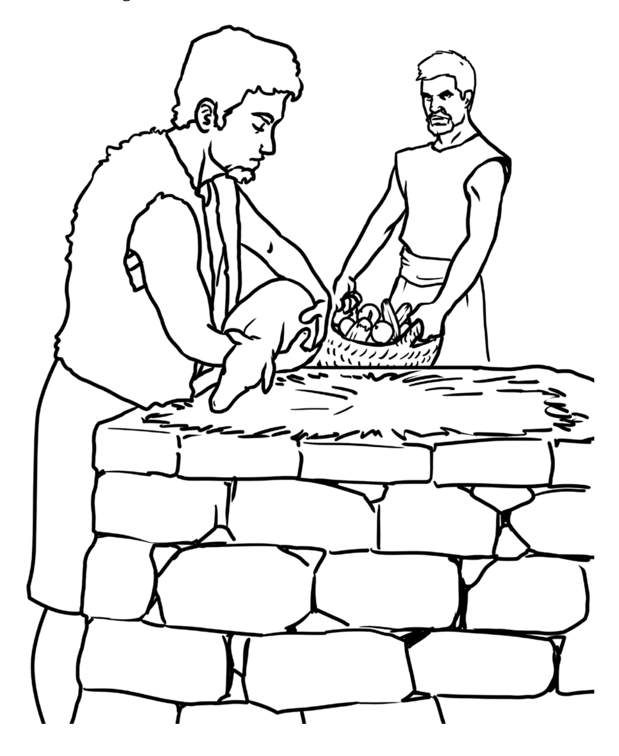
Cain became jealous when God accepted Abel's sacrifice and not his.

Cain became angry at God for rejecting his sacrifice. He grew jealous of Abel. God told Cain that if he did his best in the