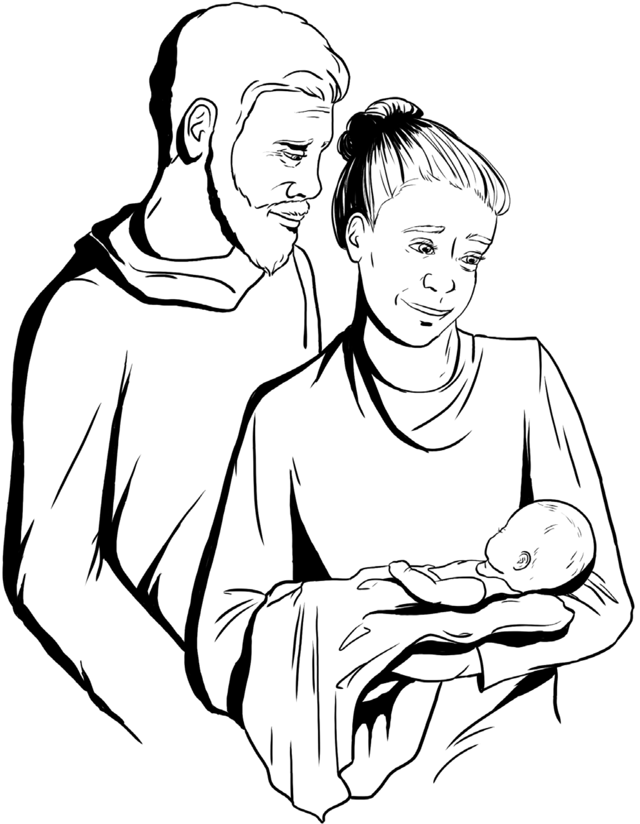
Abraham, Sarah and Isaac