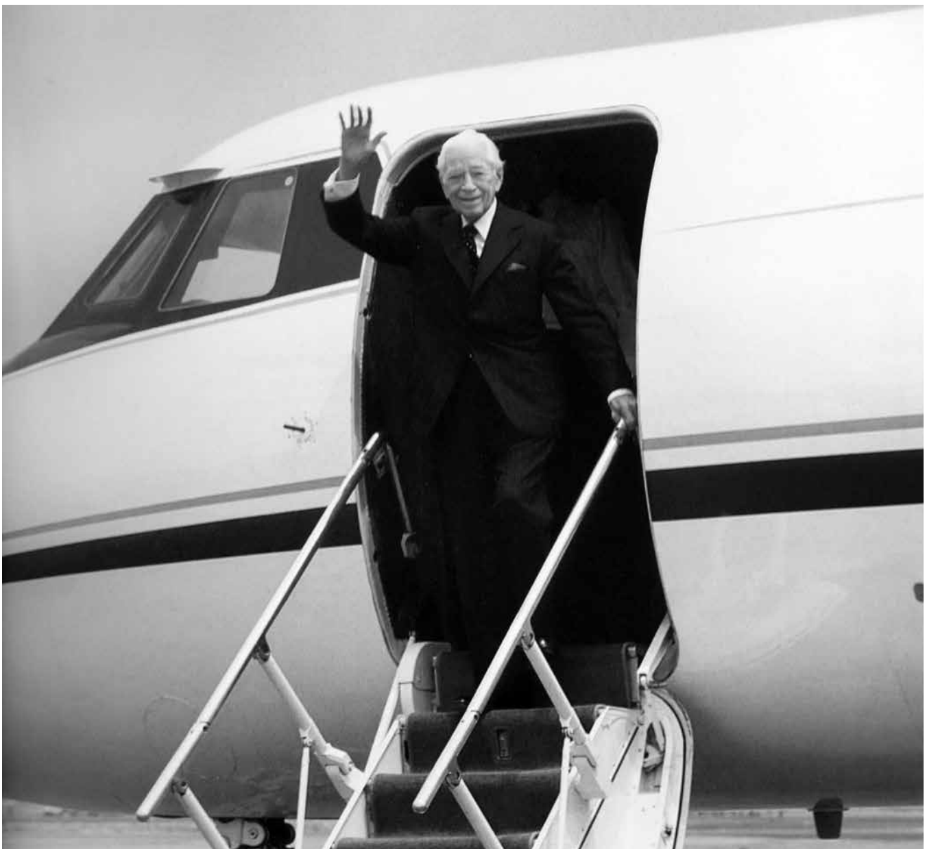
Mr. Herbert W. Armstrong was used by God and came in the spirit and power of Elijah to prepare the way for Christ's Second Coming, similar to how John the Baptist prepared the way for the Messiah in the first century.

Some time after John the Baptist was executed, Jesus took Peter, James and John up a mountain and showed them a vision. In this vision, Jesus shone like the sun and stood next to the prophets Moses and Elijah. After