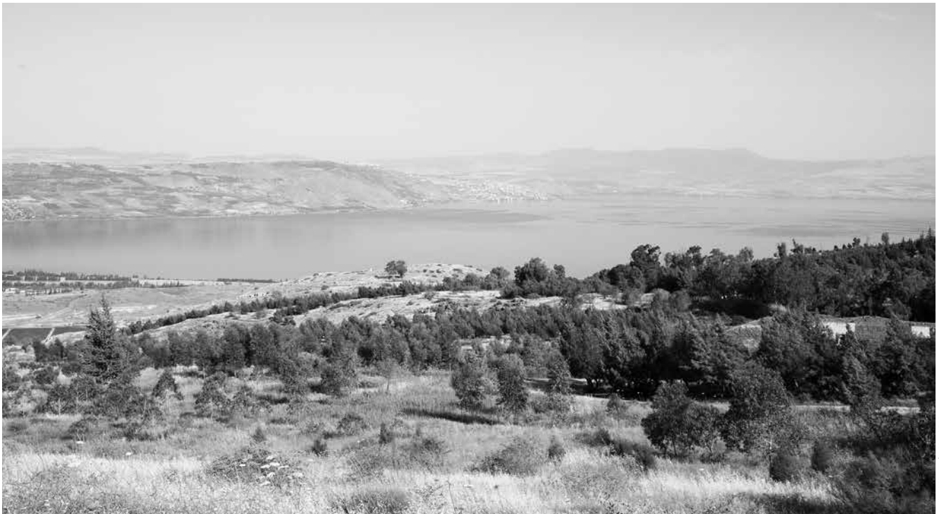
Christ called His first disciples at the Sea of Galilee.

Jesus was calling His first disciples so He could establish a Church to help teach God's way of life. After calling Andrew, Simon, Philip and Nathanael, He called two brothers, James and John. Then He called a tax collector named Matthew. Many of these disciples had been prepared to receive Jesus's message by the preaching of John the Baptist!