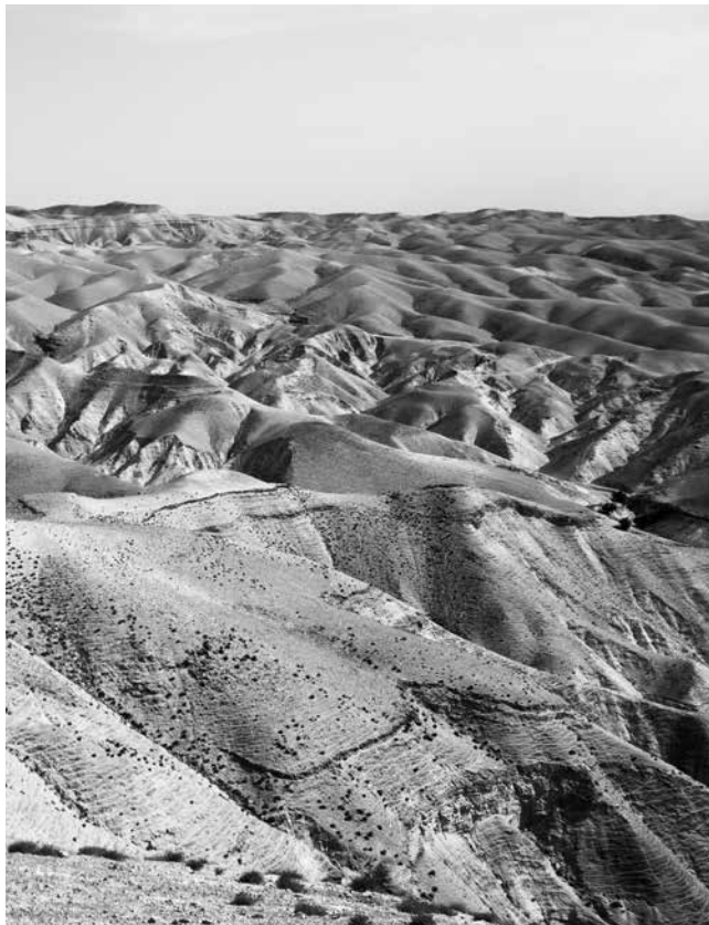
It was in the Judean wilderness where Christ qualified to be the Redeemer of mankind.

Jesus Christ came to Earth as a human being for many different reasons. Most people who believe they are Christians know that Jesus came to die to pay the penalty of sin for all mankind. Many people also know that He came to establish the New Testament Church. But far fewer realize that He had to qualify to replace Satan as the ruler of the world. That is why